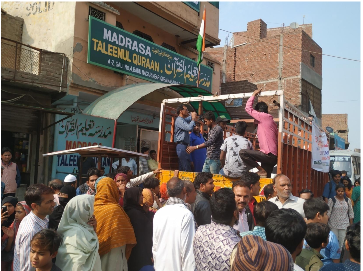
Pic - There exists a madarsa named Taleemul Quraan in its lane no. 4. Near to the same, food packets were distributed only to the people of Muslim community. In this locality the residences and shops of every single Hindus were burnt into ashes. The mob took its own good time to burn that which belonged to Hindus.

When we went ahead we saw a group of students of Jamia Milia Islamia University present there were providing relief material to Muslims community. Relief materials were unloaded from a truck inside a Madarsa, nearby. These relief materials were sent from a place called Amroha from Uttar Pradesh.