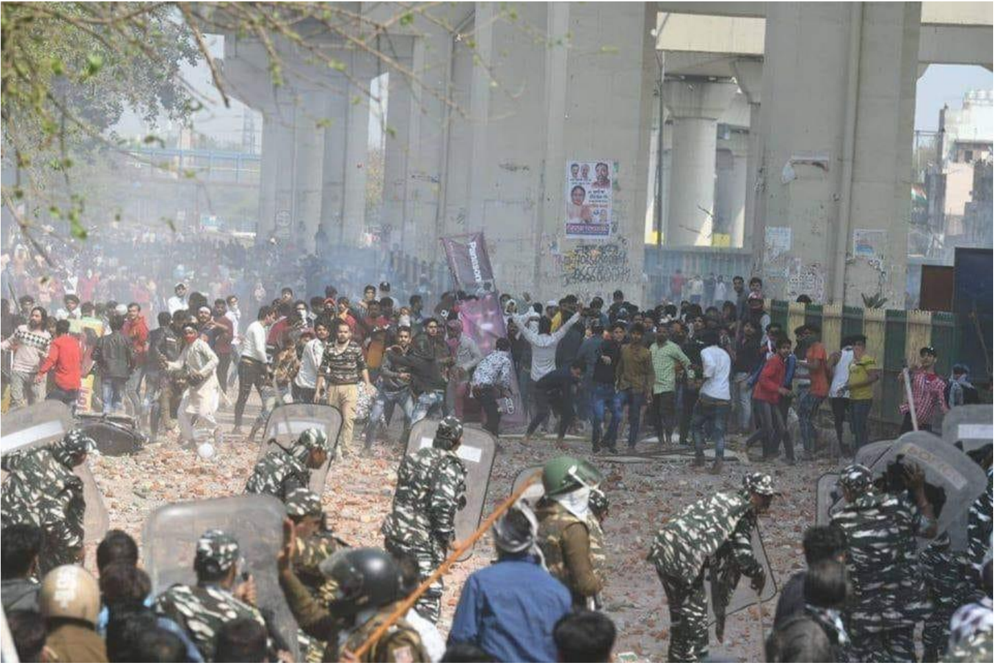
Pic - Muslim Rioters are attacking on Police

Police force stuck in between was stopping the crowd who were trying to defend themselves from the Muslim stone pelters. Seeing this a woman said “your force is not taking appropriate action against the Muslim mob on the contrary they are continuously pelting stones on us while moving towards us. If we won’t retaliate now they might enter our houses so it is obvious for us to do something to safeguard ourselves” .