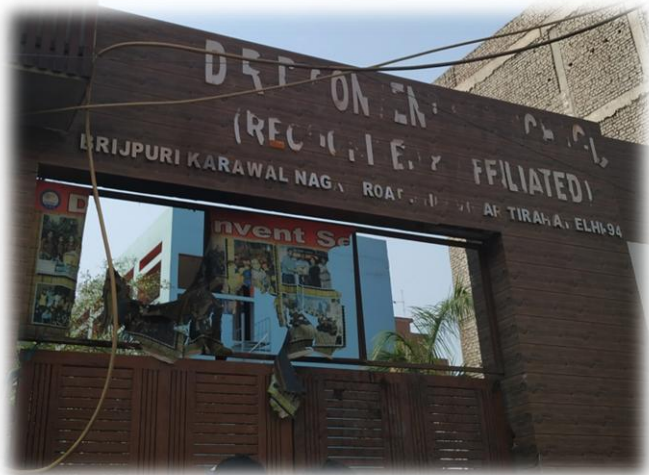
Pic – DRP Convent School

There were 2 schools (DRP Convent School & Rajdhani Public Sec School) in Shiv Vihar which were adjacent to each other. However DRP Convent School was completely burnt while the Rajdhani Public Sec School barely faced any loss.